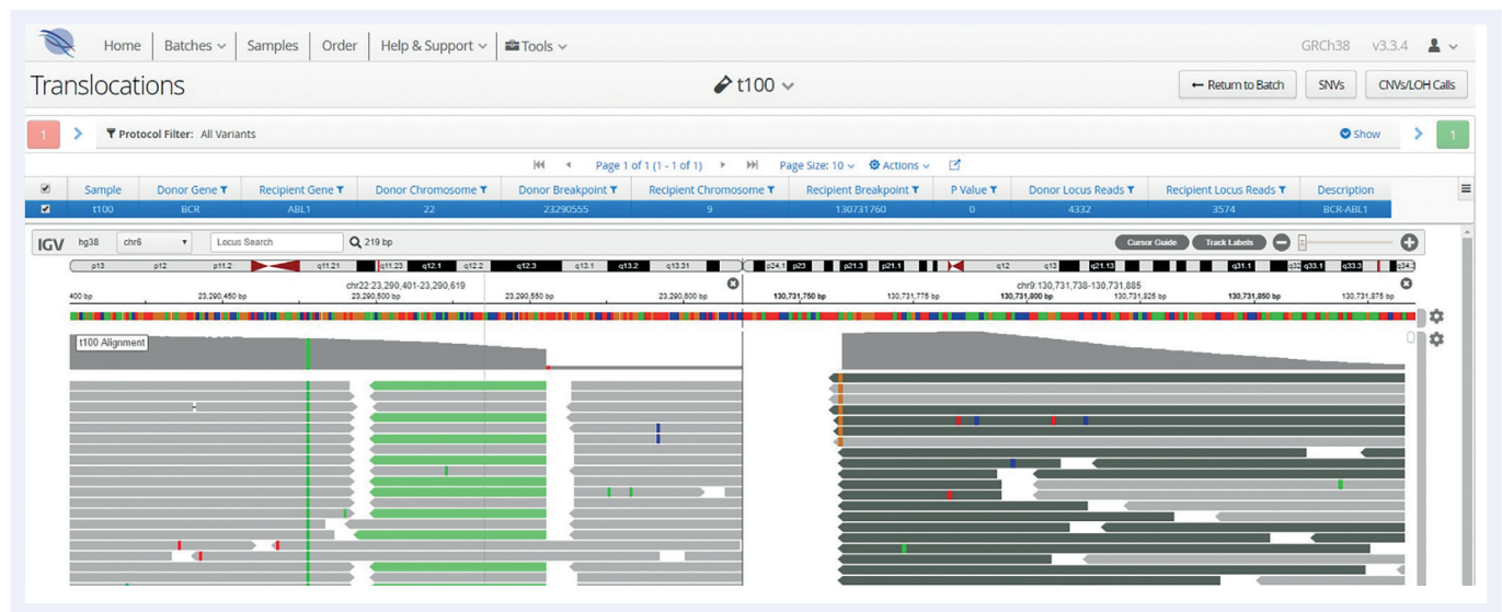
Figure 3: BCR-ABL translocation reported in Interpret. Split-reads covering both BCR (left panel) and ABL1 (right panel) are detected, indicative of the BCR-ABL gene fusion.

The BCR-ABL gene fusion is formed following a balanced translocation of chromosome 9 and 22, generating the Philadelphia chromosome. Most MPNs are negative for BCR-ABL , however this translocation is a hallmark of chronic myeloid leukaemia (CML) (Figure 3).